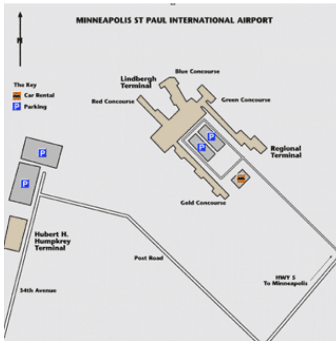
Terminal map of both Lindbergh and Humphrey terminals

Airport Details The Minneapolis – St. Paul International Airport has two separate terminals. The main or “Lindbergh” terminal serves most of the major air carriers, including Northwest, United, Delta, Continental, American, and US Airways.