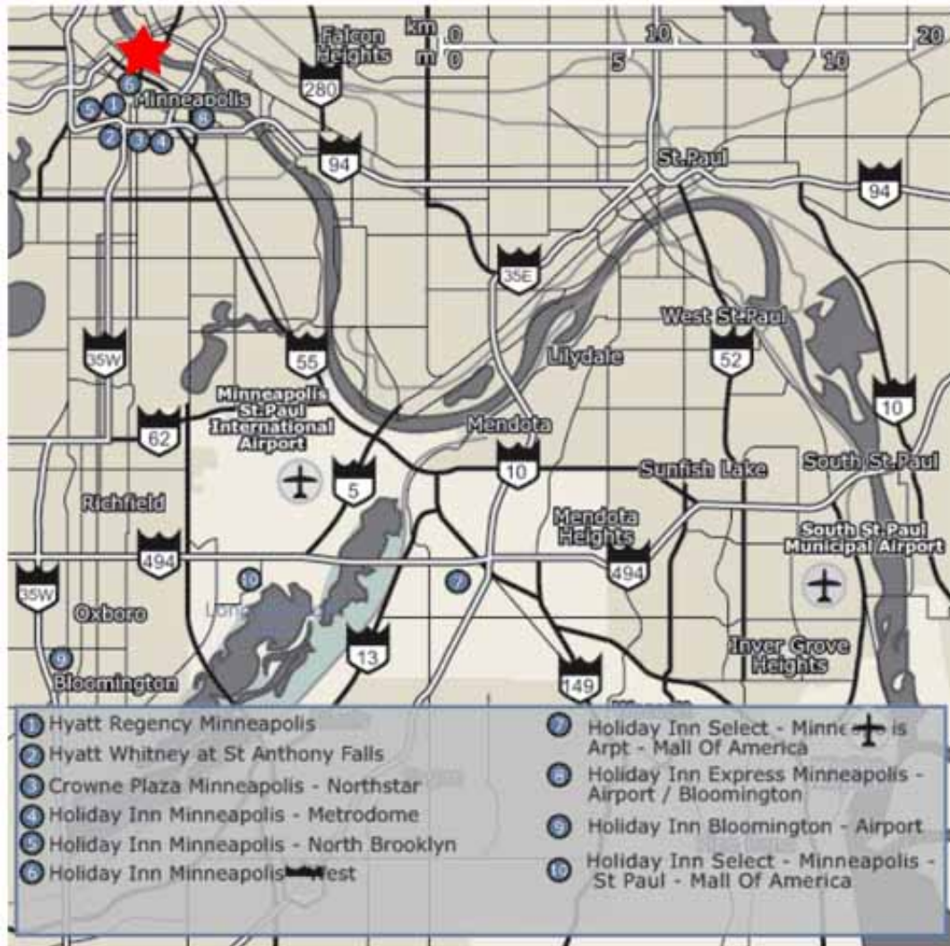
Map of Minneapolis St. Paul area and the Minneapolis St. Paul airport (star represents location of U of M - Minneapolis campus).