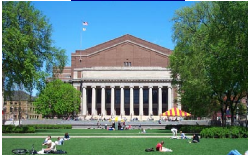
Pictured: Northrop Hall.

UNIVERSITY OF MINNESOTA - MINNEAPOLIS September 22 - September 25, 2002